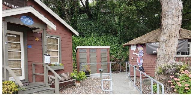
The 3 doors of the c. 1930 Bathhouse are open during business hours.

When you walk around Capitola Village, you may notice historic buildings proudly displaying blue plaques. Though the plaques do not come with any legal ramifications, they do help raise the visibility of our county's historic buildings and encourage their preservation. The program, administered by the Historic Landmark Committee of the Santa Cruz Museum of Art & History (MAH), has awarded over 150 blue plaques since 1973. At the MAH's 2024 Blue Plaque Awards ceremony, a blue plaque was awarded for the c. 1930 Bathhouse, one of three historic structures which make up the admission free Capitola Historical Museum at 410 Capitola Avenue.