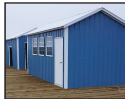
The newly reconstructed Capitola Wharf (left) and temporary structures (right).