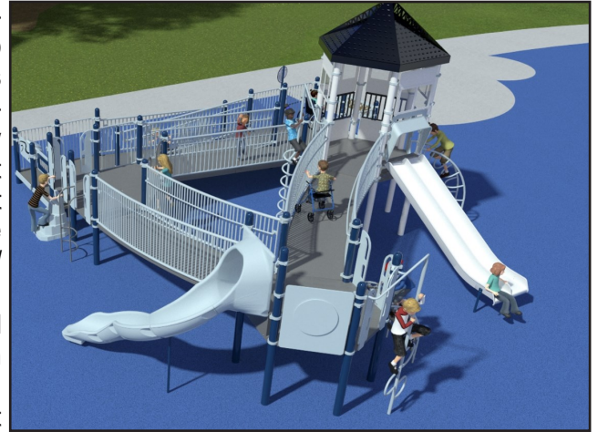
Treasure Cove at Jade Street Park design concept.

The City partnered with County Park Friends in July 2023 for a $1 million fundraising campaign to help make this dream project a reality for the community. Now, the Friends have surpassed the halfway point in their campaign and are on track to reach the million-dollar goal by the end of the year. To join in this amazing effort, get more information on the playground and the campaign, and to donate, please visit https://www.countyparkfriends.org/jadestpark .