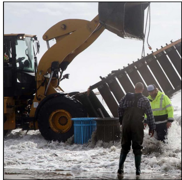
The City's Beach Loader in use during the January 2023 storms.