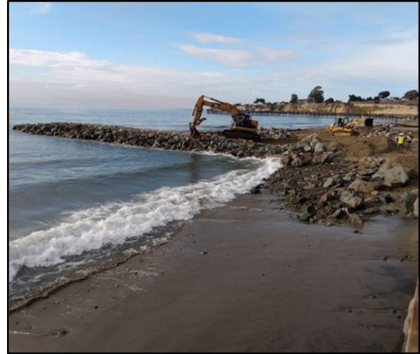
The Jetty under repair in late 2020.

Flume: In 2021, the City used Measure F funding to make major repairs to the flume, which allows the City to re-create the natural lagoon by conveying Soquel Creek underneath the sandy beach to the ocean. This gives Capitola its world-class beach and provides an important habitat for fish and other wildlife.