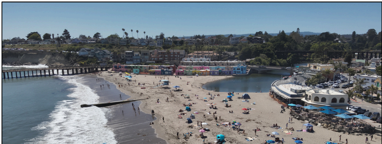
Taken June 16th, this photo shows the flume, lagoon, and the Wharf - projects accomplished with Measure F funding.