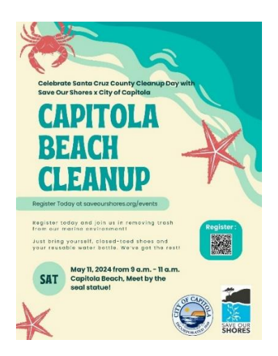
Figure 2: Example of paid event advertisement placed in the Good Times.